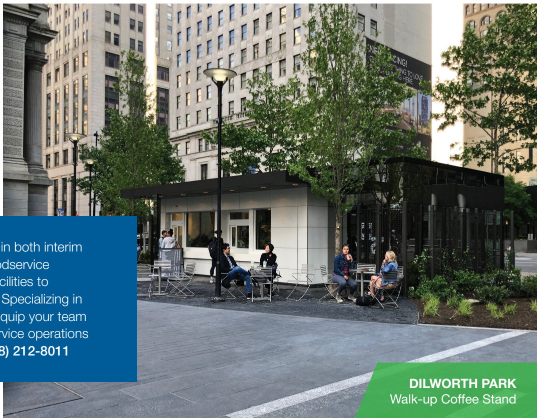
DILWORTH PARK Walk-up Coffee Stand

Kitchens To Go® is the leader in both interim and permanent solutions for foodservice providers who require flexible facilities to continue or expand operations. Specializing in small to complex projects, we equip your team with solutions that keep foodservice operations uninterrupted. Contact Us: (888) 212-8011