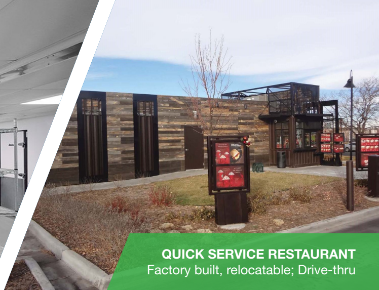
QUICK SERVICE RESTAURANT Factory built, relocatable; Drive-thru