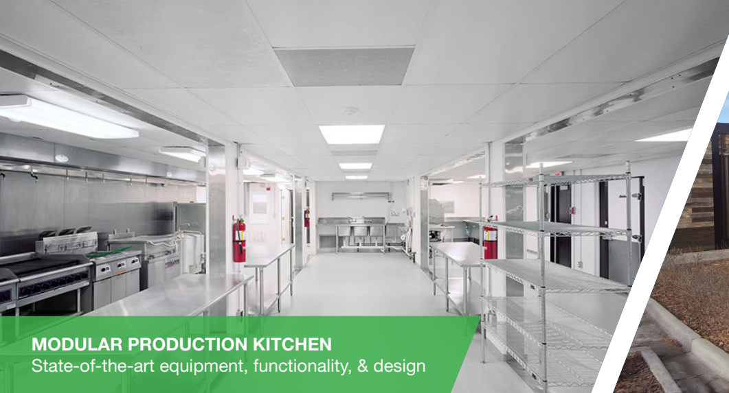
MODULAR PRODUCTION KITCHEN State-of-the-art equipment, functionality, & design