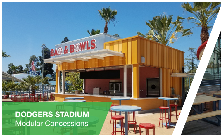
DODGERS STADIUM Modular Concessions

Kitchens To Go® is the leader in both interim and permanent solutions for foodservice providers who require flexible facilities to continue or expand operations. Specializing in small to complex projects, we equip your team with solutions that keep foodservice operations uninterrupted. Contact Us: (888) 212-8011