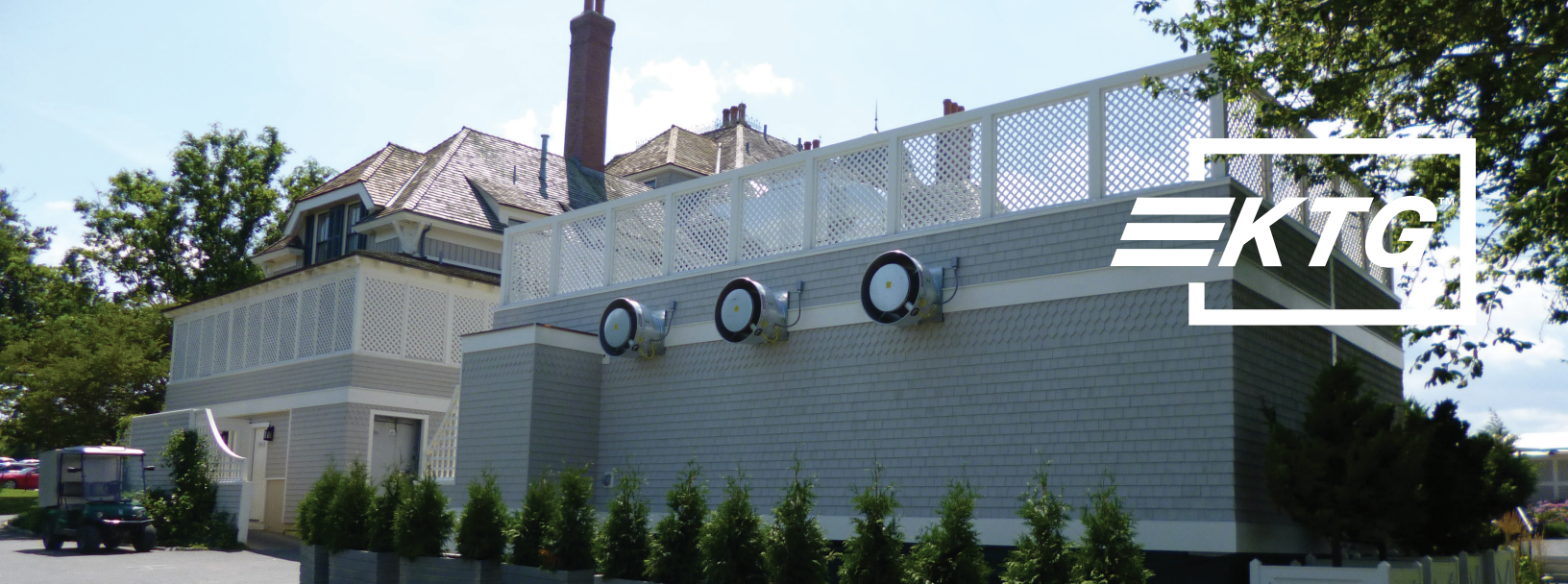
CASTLE HILL INN Modular Kitchen