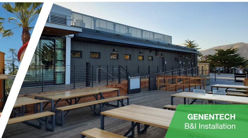
GENENTECH B&I Installation